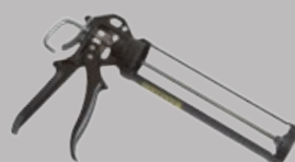
Adhesive applicator gun