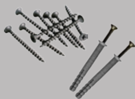
Self-tapping screw, dowel nail