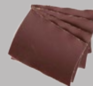
Fine grain abrasive paper