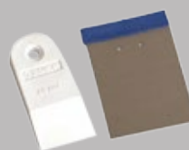
Rubber putty knife. Stripping knife