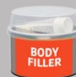
Fine grain water-soluble filler