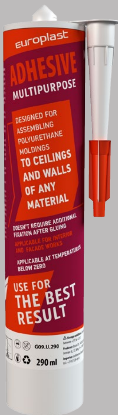
MULTIPURPOSE ADHESIVE 290 ml