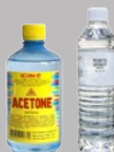
Acetone, White spirit