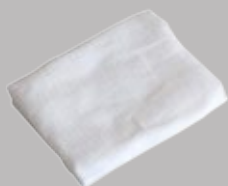
Cotton waste (Cloth)