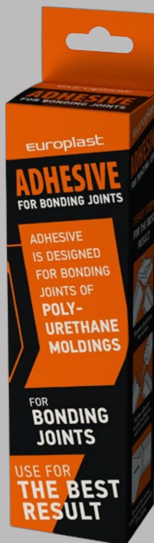
ADHESIVE FOR BONDING JOINTS 60 ml

The following information is relevant for Europlast adhesives. If you use other adhesives, follow manuals on it's package.